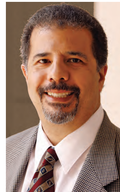
► Kim Forde-Mazrui's scholarship focuses on equal protection, especially involving race and sexual orientation.